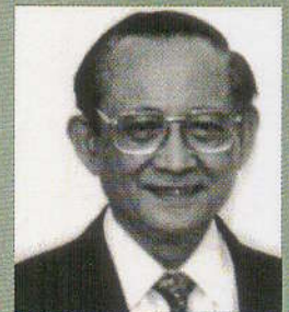
His Excellency President Fidel Valdez Ramos

MANILA, PHILIPPINES FEBRUARY 19-20, 1998